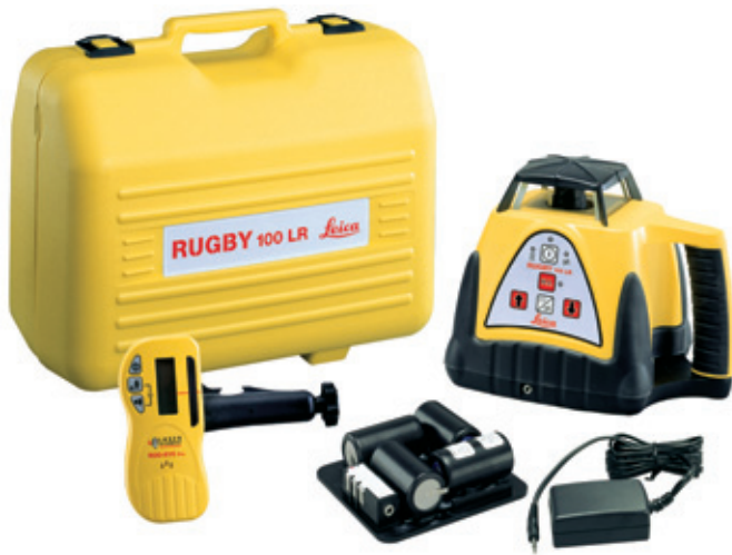
Recommended package consists of laser, carrying case, ROD-EYE Pro sensor and optional NiMH charger and battery pack