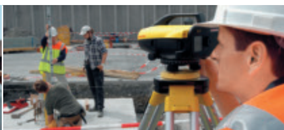
Platform/concrete casting stakeout, rectangular area stakeout, distance measuring