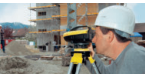
Elevation control, height control

Any levelling – at any place – for anyone Use the Leica Sprinter 50 as a multifunctional levelling tool: