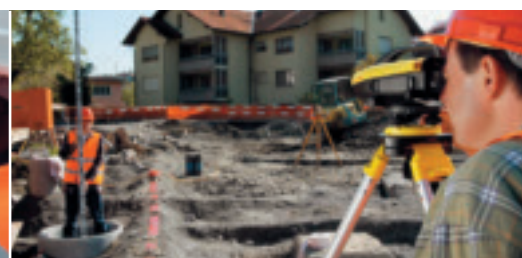
As-built elevation checking, grade checking, area levelling, volume determination of earth/dirt moving operations